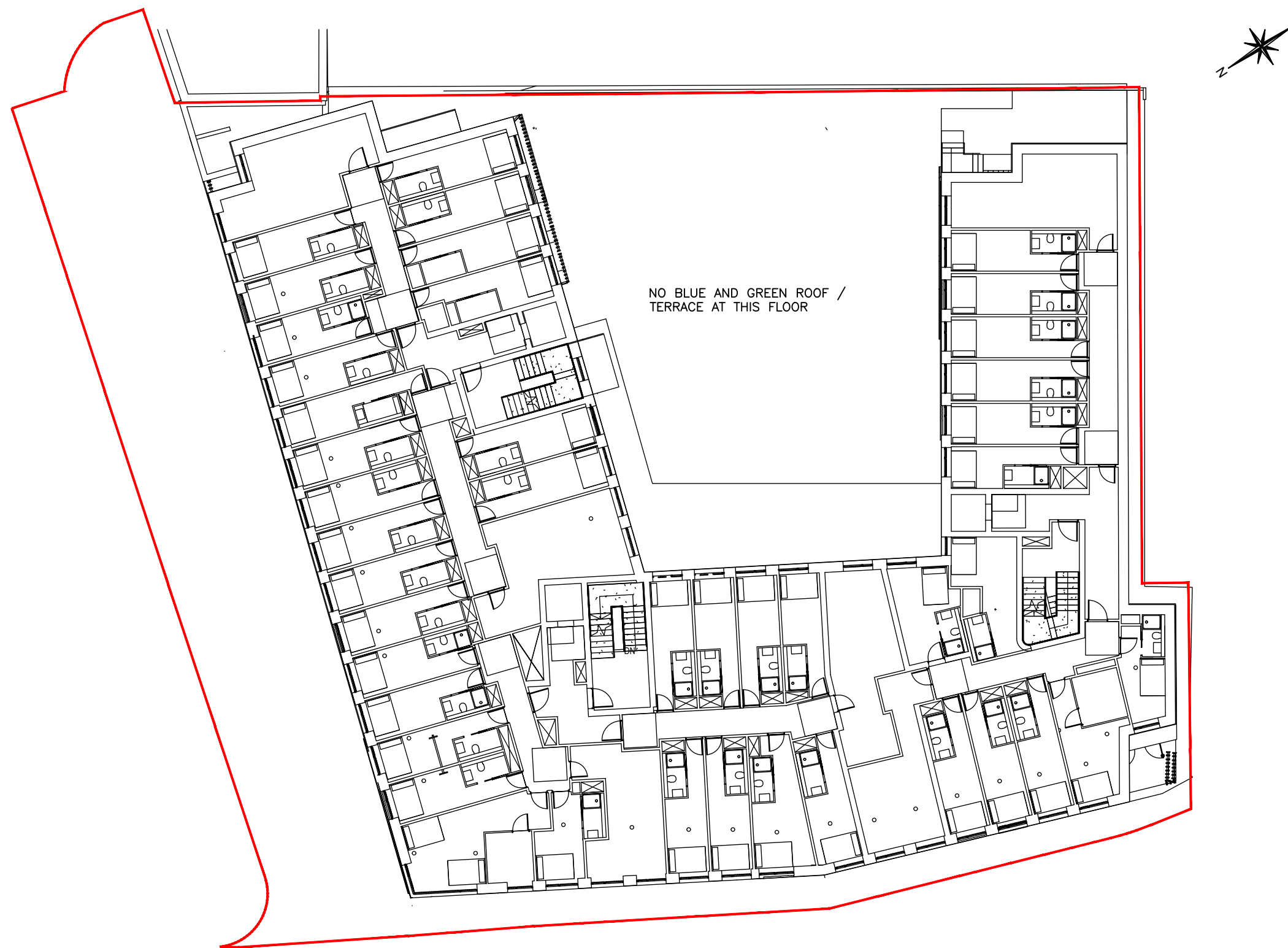
2 SECOND FLOOR PLAN SCALE 1:250