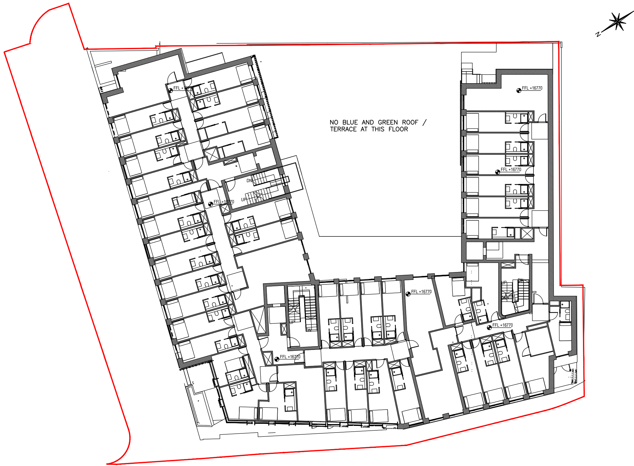
1 FIRST FLOOR PLAN SCALE 1:250